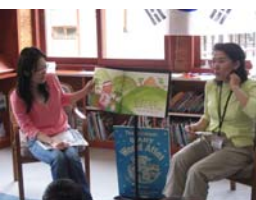
Story Telling Around the World