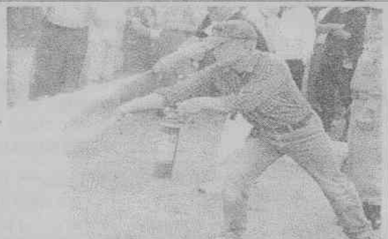
(People practicing with fire extinguishers at the training event)

What: There's going to be first-aid training, a smoke room where you learn how to escape a smoke-filled room, and fire-extinguisher training. There's going to be actual rubble from which you have to save someone, a squashed-car-rescue demonstration, and many other crucial and interesting activities. The Japan Self Defense Forces are going to be there, and to top it all off, there may be some free food to eat at the end. There may not be a translator present, but in a disaster, there's probably not going to be one either, so I strongly suggest that you participate in this event! (Obihiro University students should ask their teachers about the shuttle bus going to the event)