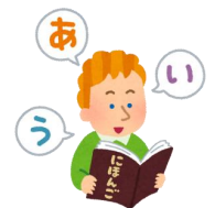
Recruitment for Japanese Conversation and Learning Table (pg. 3)