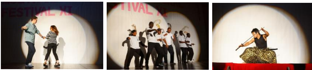
Performances from the 11th Multicultural Festival

Stage events include performances from both local and foreign groups, which showcase dances, songs and musical performances unique to each group's country, as well as a fashion show where models don each country's traditional clothing.