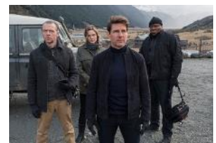
Movies, September Sightseeing Spots In Hokkaido (pg 4)