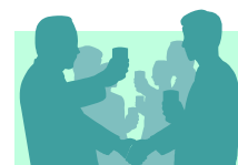
Events (pg. 2, 3)