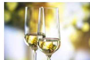
44th Annual Wine Party (pg. 1)