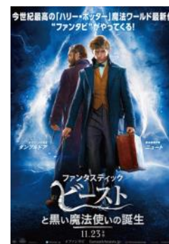
Movies, Winter Tea Ceremony (pg. 4)