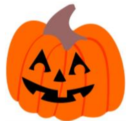
Halloween Activities (pg 1 & 3)