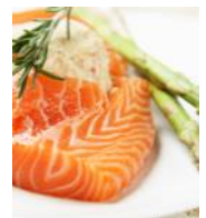
Culture & Cuisine (pg 3)