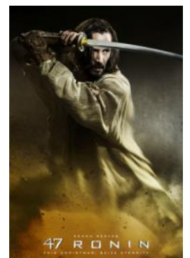
Movies (pg 4)