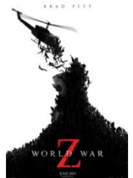
Movies (pg 4)