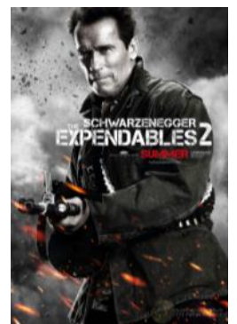
Movies (pg 4)