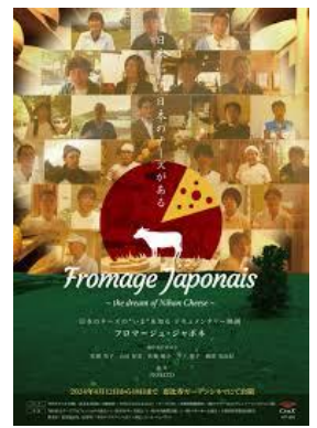
Fromage Japonais ~the dream of Nihon Cheese~

KEY: EN = English voice with Japanese subtitles JP = Japanese voice with no English subtitles