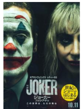
Joker: Folie à Deux