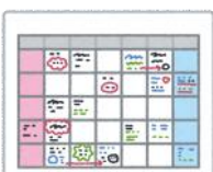
Events Page 4