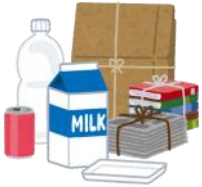
How to Separate Garbage #2 Page 1, 2, 3