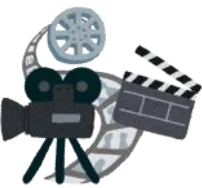
Movies Page 3