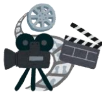
Movies Page 3