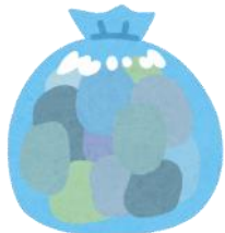
How to Separate Garbage #1 Page 1, 2, 3