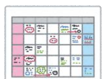
Events Page 4