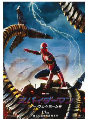
Spider-Man: No Way Home

KEY: JP = Japanese voice EN = English voice with Japanese subtitles