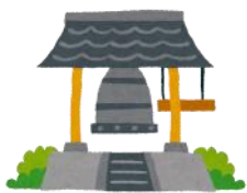
Joya no Kane