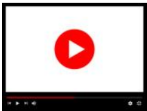
TIRC's YouTube... Page 3