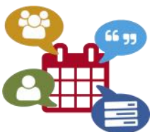
Events Page 4