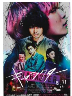
Movies (pg 4)