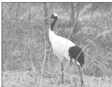
I saw this nice bird hanging out near Honbetsu!

The Ainu had a strong reverence for the tancho . It was considered a kamui (god) from the swamplands called sarorun . Its dance was a symbol of natural beauty and was honored by a dance developed by the Ainu called sarorun rimse (crane dance) in which women dressed in blue traditional clothing and performed a dance imitating the dance of