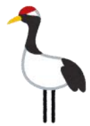
The Red-Crowned Crane of Hokkaido (pg 1,3)