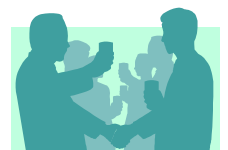
Events in Tokachi (pg 2)