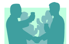
Events in TIRC (pg 2) Events in Tokachi (pg 3, 4)