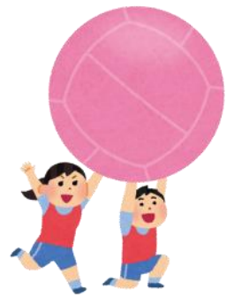
May-time sports in Tokachi (pg 1,3)