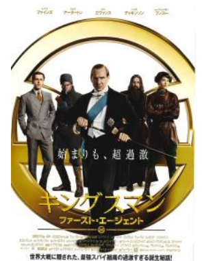
Movies (pg 4)