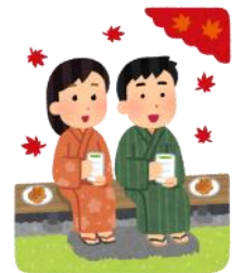
Learn Nihongo! Autumn Vocab (pg 3)