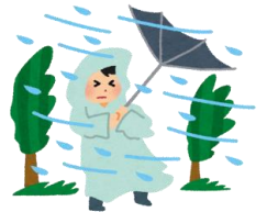
Learn Nihongo !: Typhoon Season (pg 3)