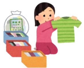
Goodbye Winter, Hello Spring! (pg 1, 3)