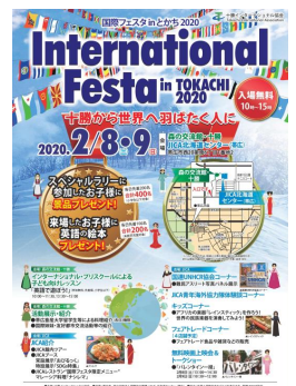
International Festa, Obihiro Ice Festival (pg 3)