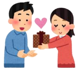
Valentine's Day in Japan (pg 1)