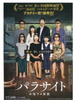
Movies (pg 4)