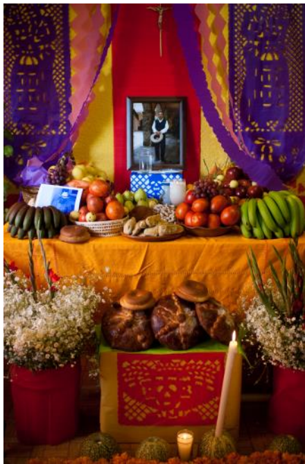
Día de muertos en Milpa Alta

any of these other festivals, why not give it a try?