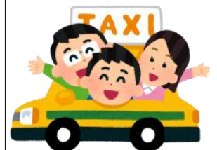
How to Call a Taxi in Japan (pg 1, 3)