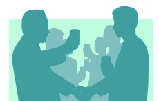
Events (pg 2, 4)