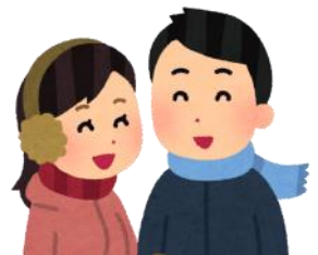
Winter Preparation Tips (pg 1, 3)