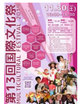
13th Multicultural Festival (pg 3)