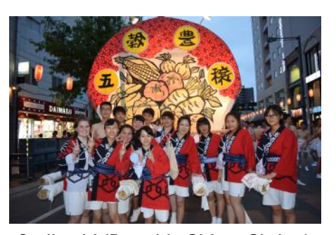
Omikoshi (Portable Shinto Shrine)

Participants can enjoy multiple performances, such as the Heigen Taiko Performance and Street Performances at Kita no Daichi.