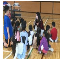
Farewell Miao-San! (pg 1 & 3)