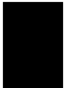
Movies (pg 4)