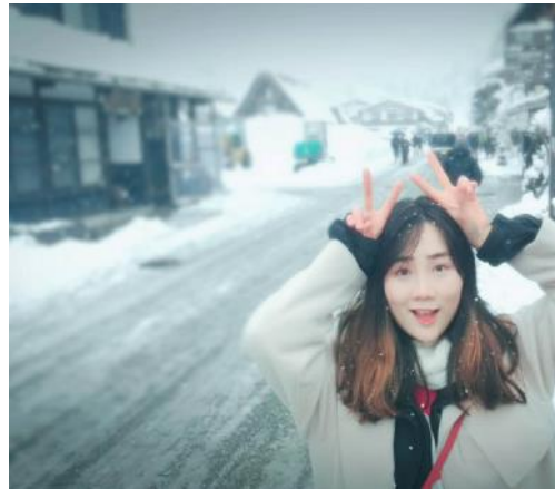
Out enjoying the snow!

Miao: It's still cold! Just as I thought, it's too cold here for me! But I've been able to warm up by going to the onsen 温泉 or hot springs. The Moor hot spring water here is amazing. It's the perfect way to blow off steam (literally!) after a long strenuous day at work.