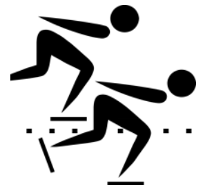
2018 Tokachi Olympians (pg 3)