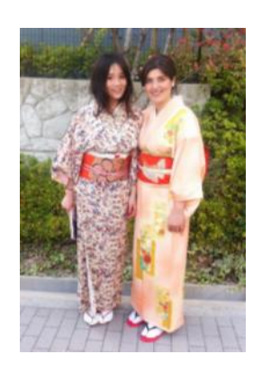
Miao-San Interview (pg 1 & 3)