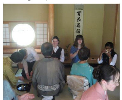
Contact/Reserve: Please call the TIRC office to reserve your spot! Reservations can be made from May 6th to the 26th.

For Obihiro citizens, 300 yen for a tea ceremony experience,500 yen to experience making tea and learning etiquette.