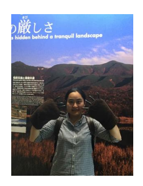
Farewell Tao (pg 3)