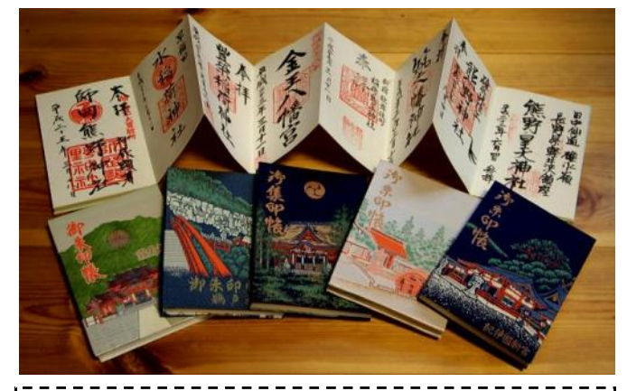
Various goshuinchou showcasing amazing penmen ship!

Stamp rallies are a simple way to advertise and introduce various areas/stores/foods. Customers are given a goal to complete