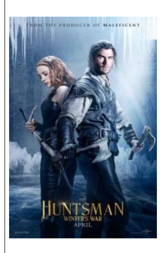
Movies (pg 4)

There will be 3 sessions for 10 participants each (total 30 persons). Each session is 45 mins. starting at 10:00, 11:00, and 13:00.