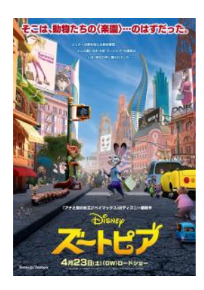
Movies (pg 4)

May 1st to the 20th. Tel: (0155) 34-0122