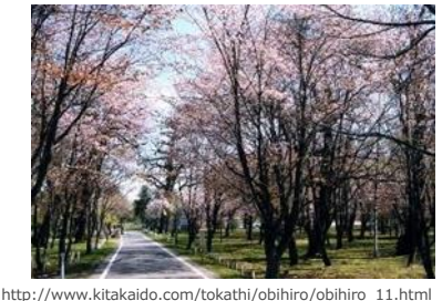
Number 2 : Kiyomi Park (Ikeda Town)