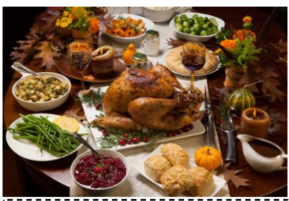
A traditional Thanksgiving feast, including the star dish, a baked turkey.

On the forth Thursday of every November falls Thanksgiving Day. While the origins of the American Thanksgiving is well debated over, modern Thanksgiving has become an extended weekend of food, family and...shopping! The forth Thursday and the following Friday are national public holidays, making it a very popular period to travel. Thanksgiving itself is usually celebrated with a large feast of fall foods, shared together with close friends and family. The contents of the feast varies amongst families, but the most famous dish has to be the turkey. Considerably larger than commonly eaten chicken, a turkey takes several hours to cook and is accompanied by many other sides like mash potatoes and cranberry sauce.