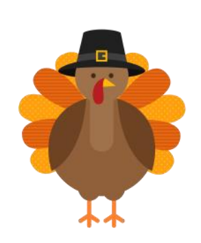
Culture: American Thanksgiving (pg 3)