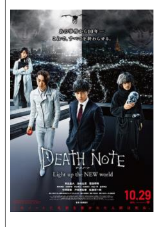
Movies (pg 4)